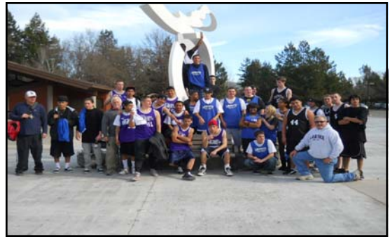
NBAAA Tourney February 8, 2011 Rohnert Pk.

The big winners for the tournaments were Ridgway with two impressive victories over Laguna and Liberty in February and Valley over Olympic in the March tourney. Play was hard and clean and the refs exceptional. It was great fun all around!